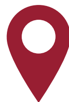
Sant Pol de Mar Barcelona (Spain)