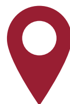
Sant Pol de Mar Barcelona (Spain)